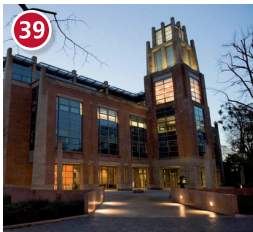
The McClay Library