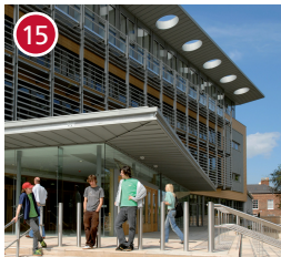
The Students' Union