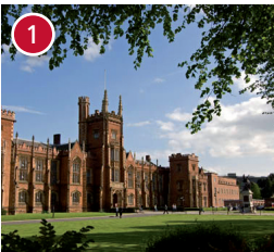
The Lanyon Building