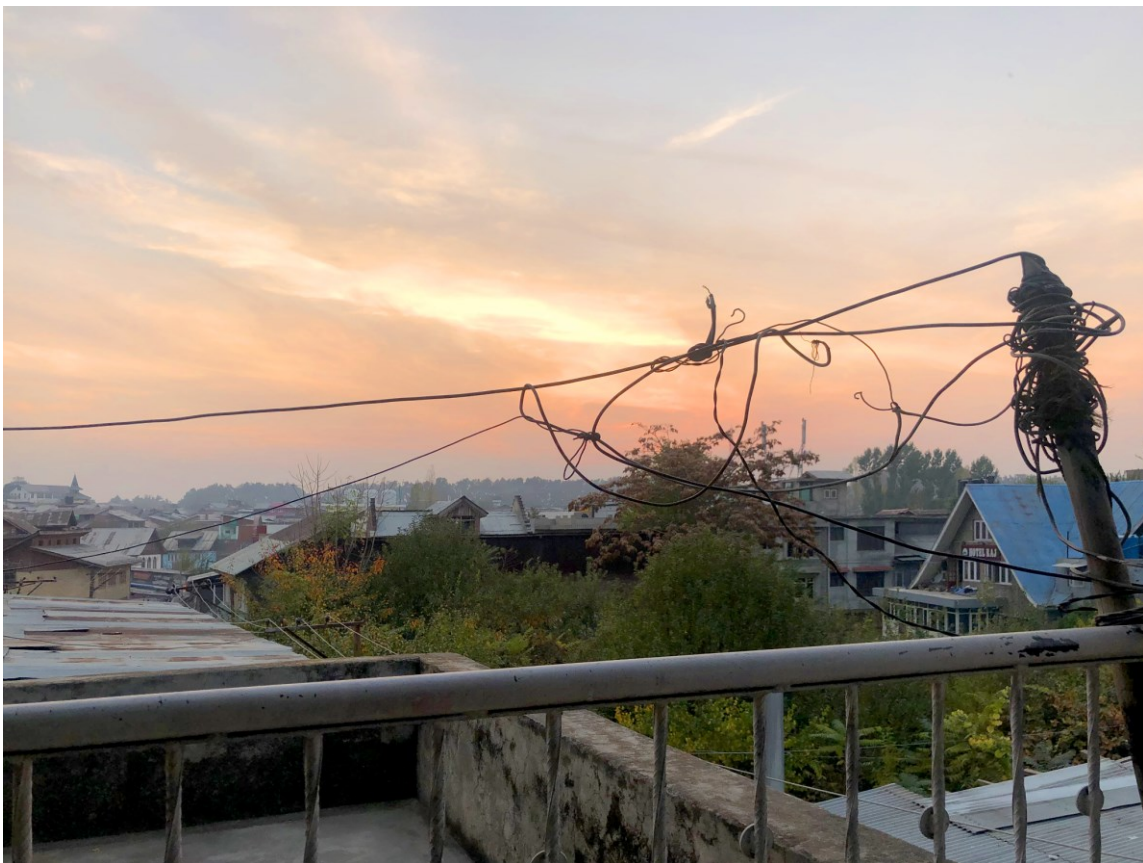
Improvisations, Srinagar, October 2024

APeCS Conference 2025, University of Edinburgh, 2-3 June 2025